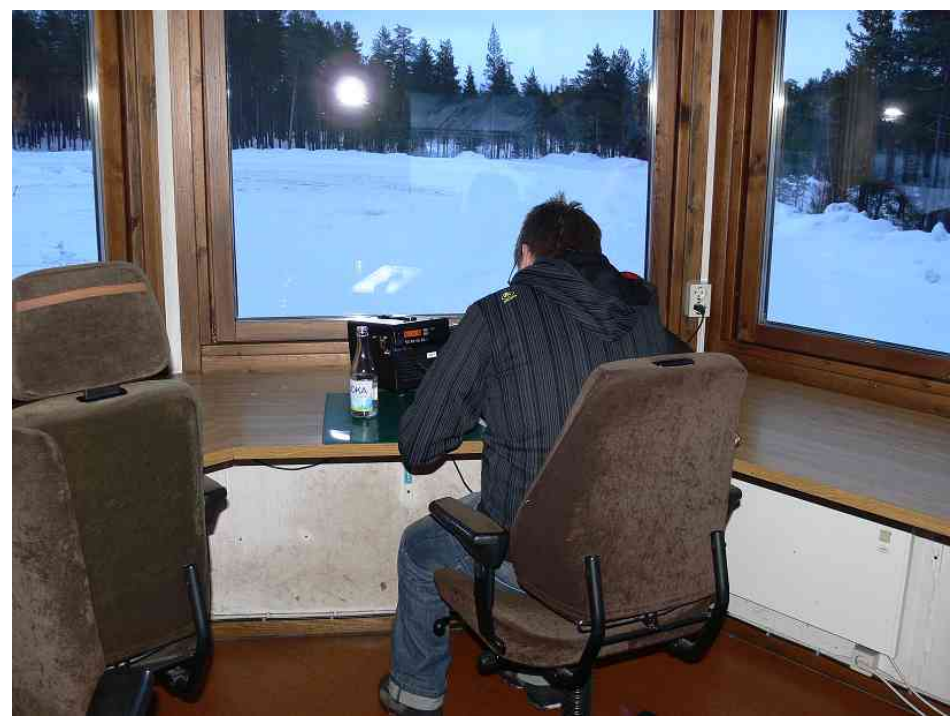
Photo 22 Training course: instructor commands by the radio station