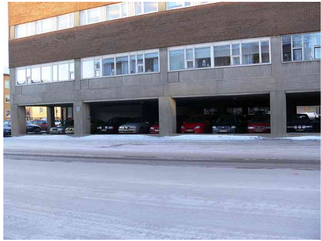
Photo 29 Luleo: parking on the ground floor of administrative building