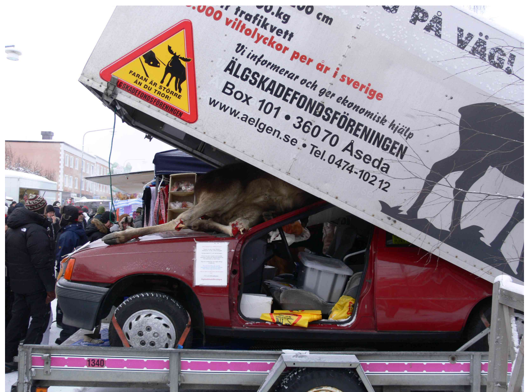
Photo 42,43 Jokkmokk province: information camping aimed at animal accidents