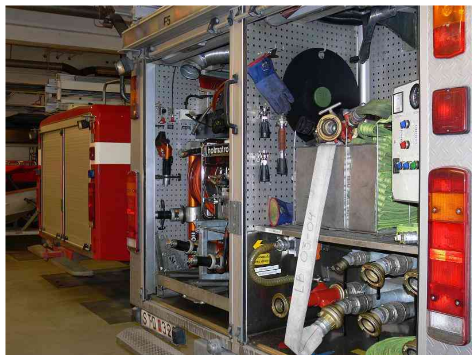
Photo 12 Luleo rescue center: modern equipment for fire extinguishing and metal scission