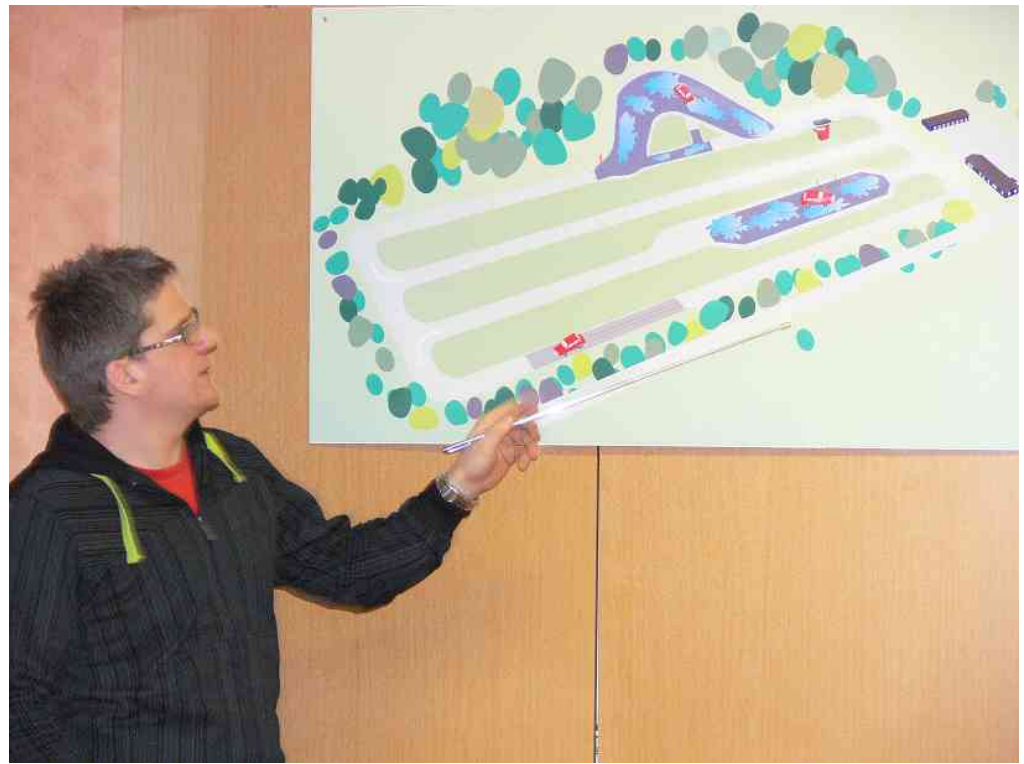
Photo 18 Piteo: theory before driving (speed limits, where to apply the brakes)